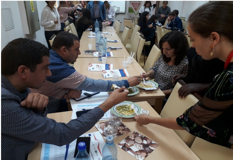
Participation in « Les journées Scientifiques de l'AgroAlimentaire » Organised by AMIAA, Mars 2019